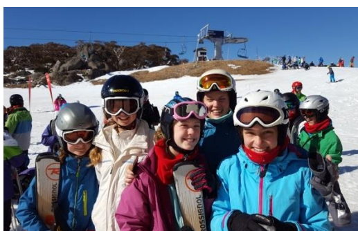
Cammeraygal Winter Academy See Page 3

01 PRINCIPAL'S REPORT 03 STAFF REPORTS 07 P&C